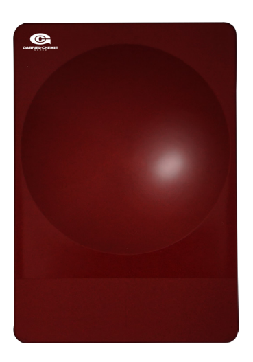
HP4AC1177 Cranberry Crush E=5% in PP