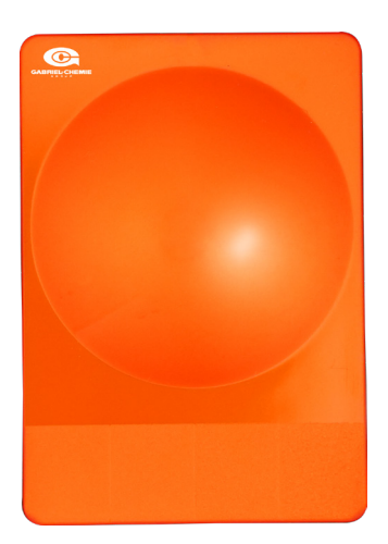
PET3DA8247 Canyon Cliffs E=3% in PP