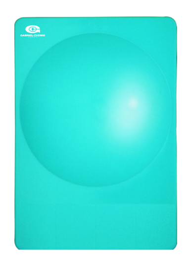
HP5BC7817 Tropical Blue E=4% in PP