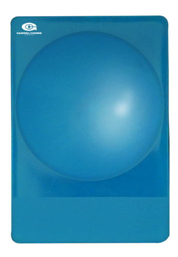
HP5DB4357 Swimming Pool E=1% in PP