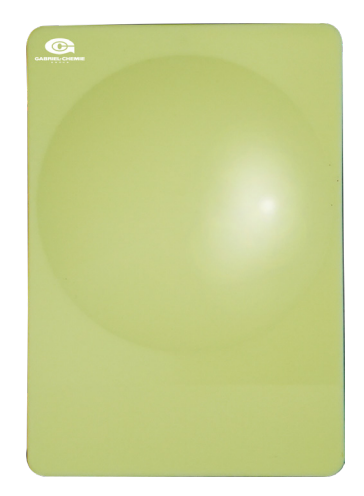
HP2BA8527 Vanilla Sky E=4% in PP