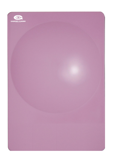
HP4BC0327 Dahlia Pink E=4% in PP