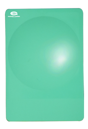
HP6BC0907 Fresh Mint E=4% in PP