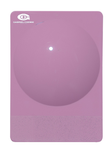
HP4BC0327 Dahlia Pink E=4% in PP