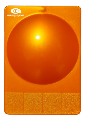
PET3DA8247PEARL Canyon Cliffs E=3% in PP