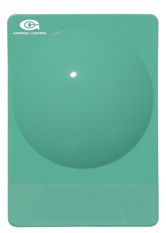
HP6BC0907 Fresh Mint E=4% in PP