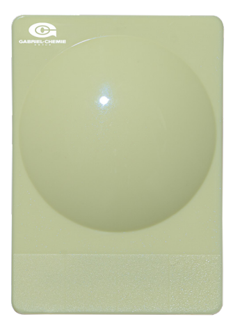
HP2BA8527PERLMUTT Vanilla Sky E=4% in PP