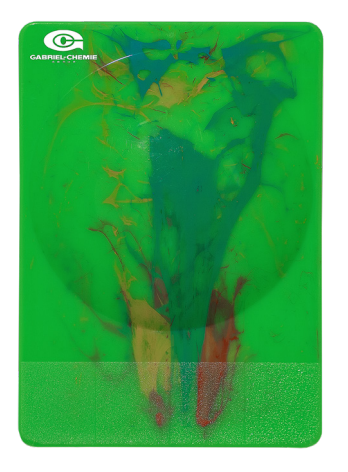
UNS6BC0897MARBLE Flip Flop E=3,5% in PP