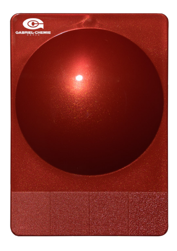
HP4AC1177METALLIC Cranberry Crush E=5% in PP