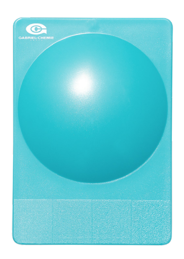
HP5BC7817PERLMUTT Tropical Blue E=4% in PP