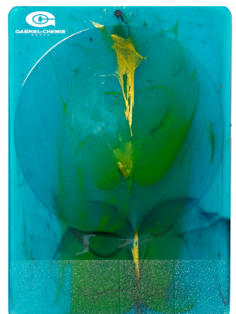
UNS6BB9307 MARBLE E = 2%