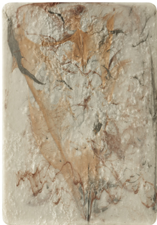
UNS7BA5717 MARBLE E = 7%