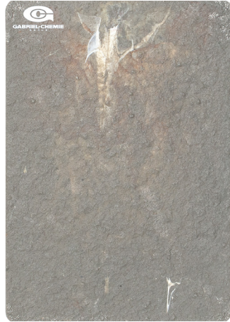
UNS9BC0847 MARBLE E = 4,5%