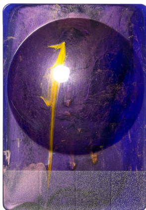
UNS5BC5767 MARBLE E = 4%