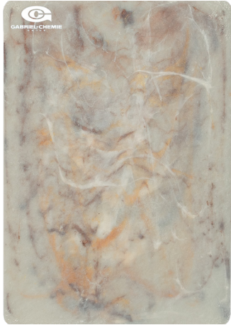
UNS9BC0857 MARBLE E = 6%