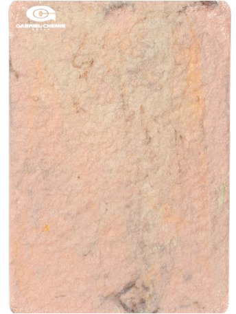
UNS4BB8287 MARBLE E = 5%