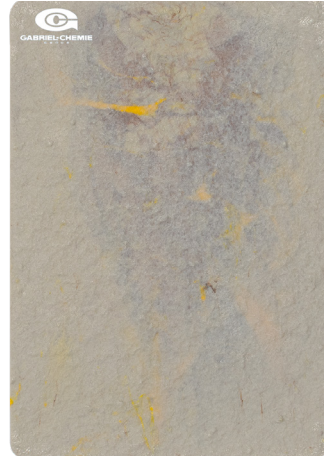
UNS9BC0867 MARBLE E = 5%